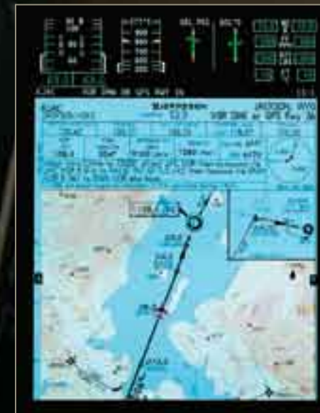
Electronic Charts – approach, departure and arrival procedures, airport diagrams with aircraft position plotted, chart NOTAMs