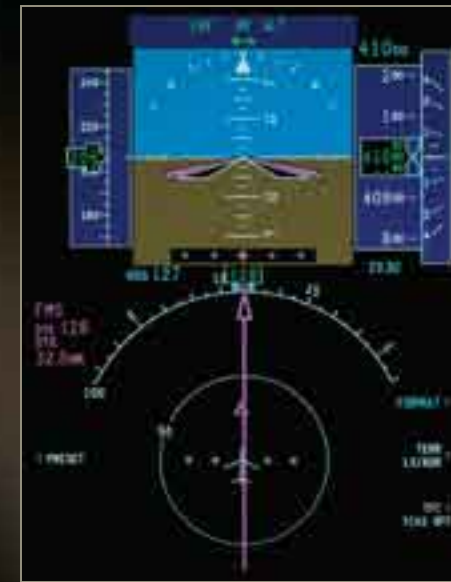
Primary Flight Display – PFD