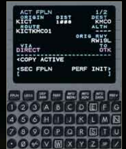
Collins FMS-3000 – advanced flight planning, multisensor navigation and flight management