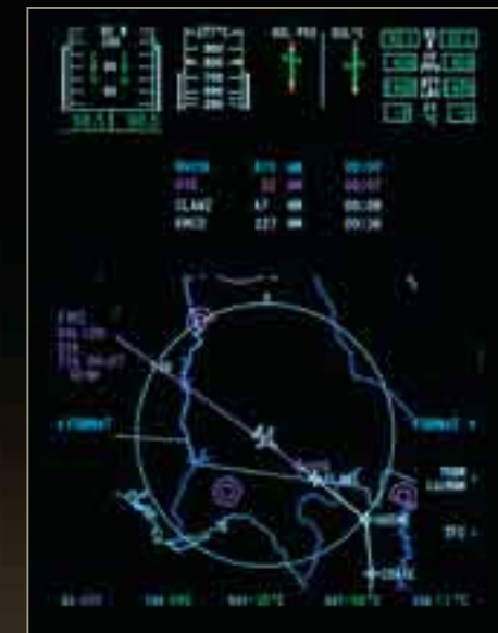
Enhanced Multi-Function Display – EMFD